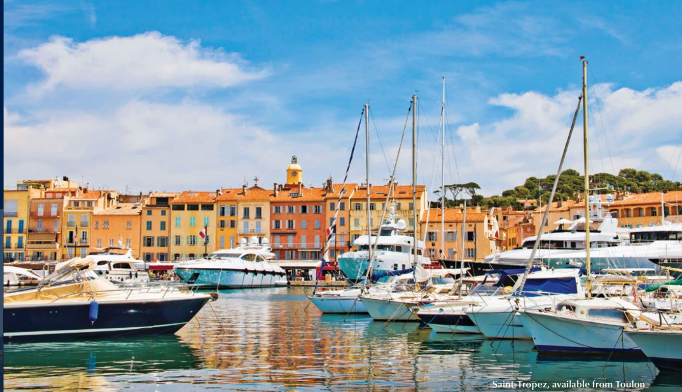
Saint-Tropez, available from Toulon